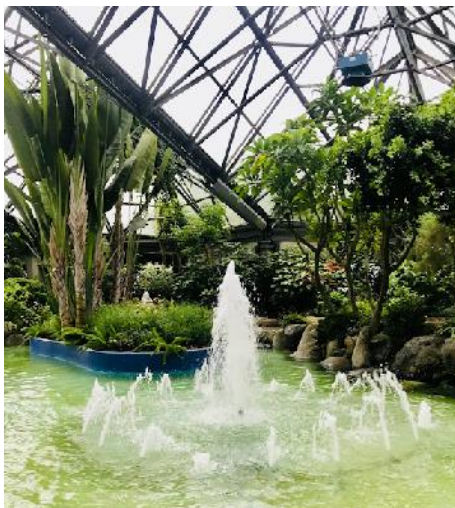
Yeomiji Botanical Garden